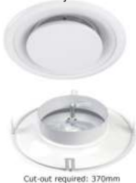
Cut-out required: 370mm

Aesthetic swirl vanes for even air distribution Internal adjustable air damper filter