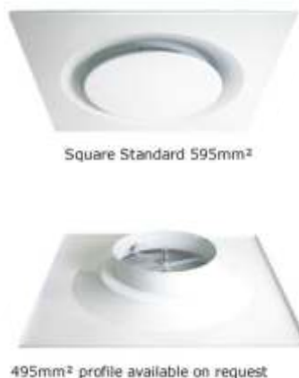
Square Standard 595mm 2