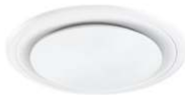
Circular Non-Standard 650mm Ø