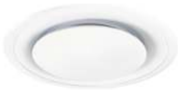
Circular Standard 535mm Ø