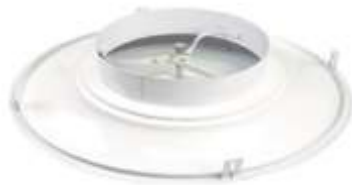
Cut-out required: 515mm