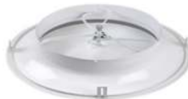
Cut-out required: 535mm